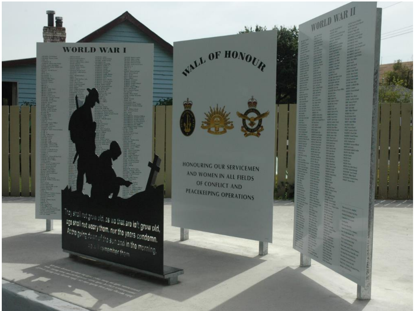
Glenora Wall of Honour