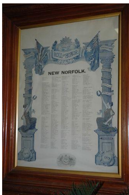
New Norfolk Honour Roll