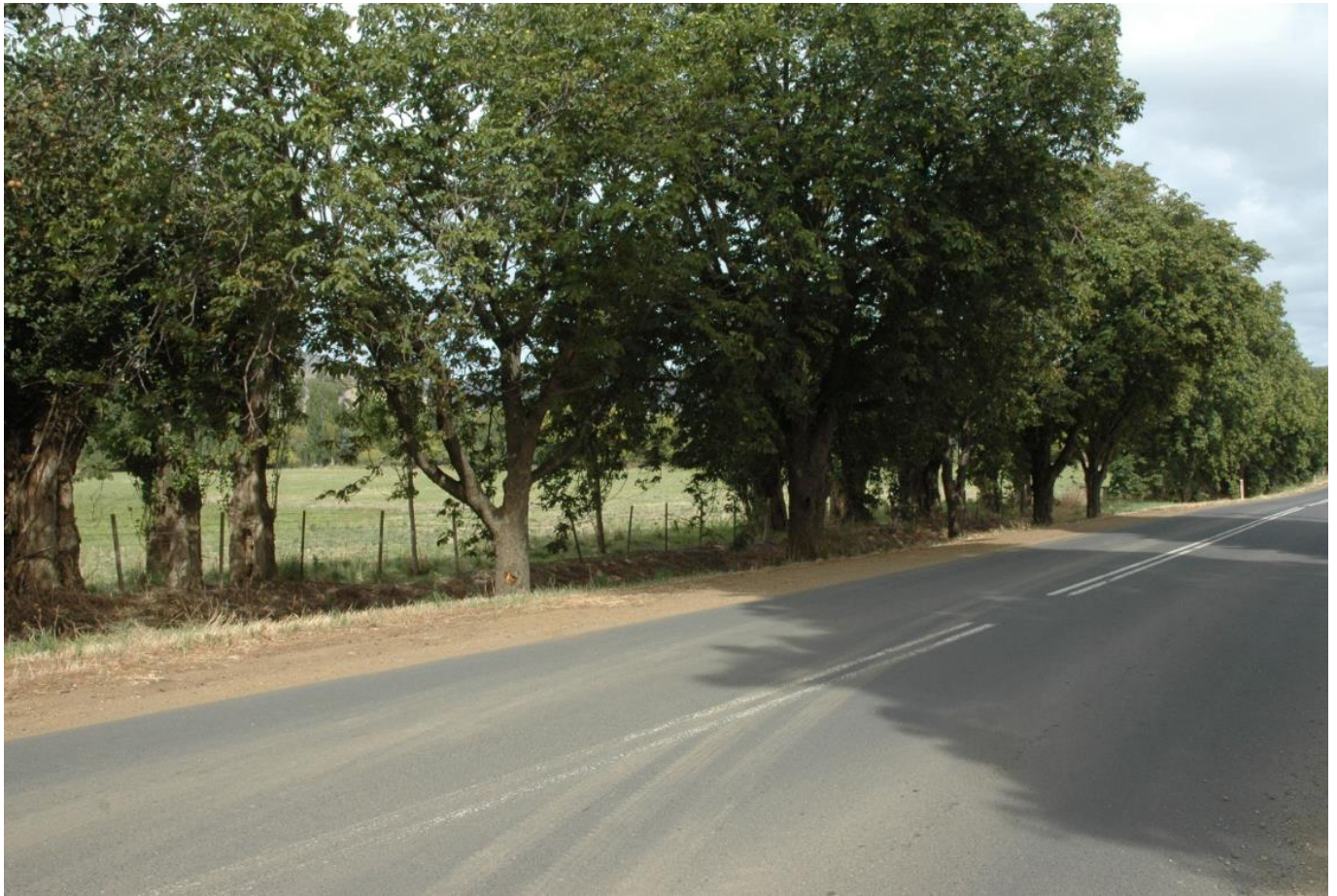
Bushy Park Avenue of Honour